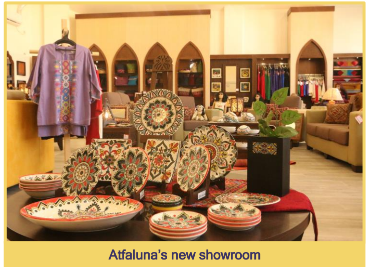
Atfaluna's new showroom

A number of new products were introduced during the year including: cross-stitch women’s shoes, bags, keychains, women’s blouses, neck scarves and children’s dresses. In