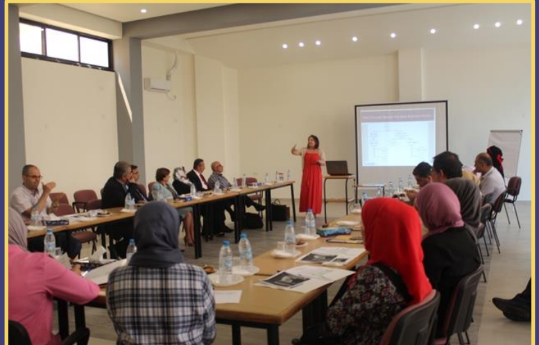
Introducing the Social Business Model with ASDC Staff and Partners