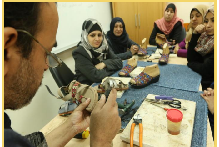
During a vocational inclusive training session