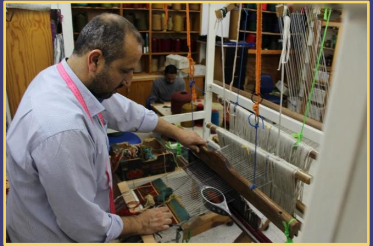
Hand-Weaving Crafts Production Unit at Atfaluna