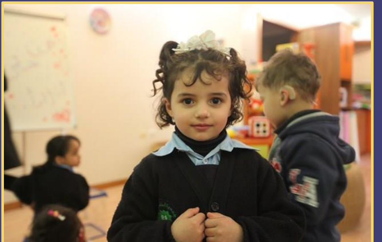
Dear Education Program at the Atfaluna School for the Deaf