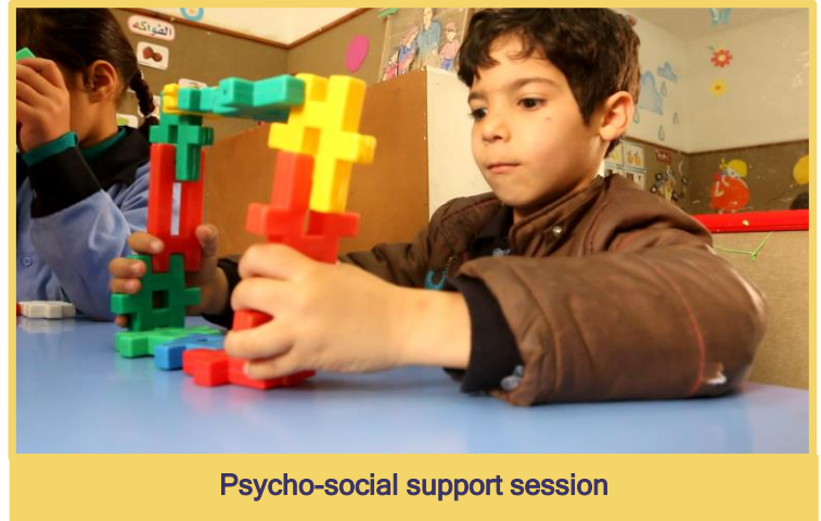
Psycho-social support session

During the year 2016 ASDC began to focus on child protection as an important component of the ASDC work. Having operated a child filled environment for many years it was an important step to take in order to monitor and maintain a child-safe environment. As of the year 2017 ASDC formally compiled a child protection policy in line with local and international standards and is currently fully committed to it.