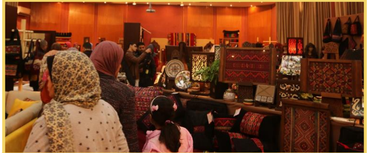
Atfaluna's annual bazaar 2018

Moreover, ASDC has established Atfaluna Crafts points of display and sale in some of the leading restaurants and hotels including the Al-Deira, Al-Mashtal and Level-Up.