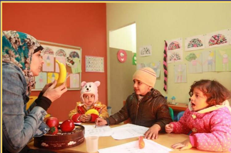
Early Intervention Program for deaf children (aged 0-5 years)