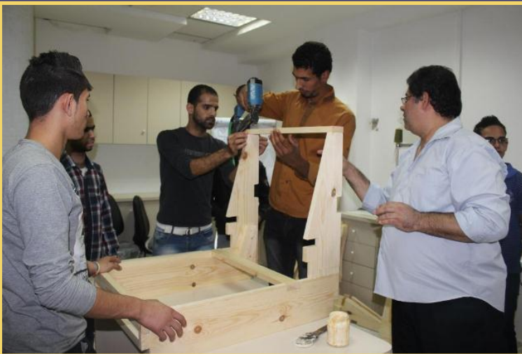
Upholstery Vocational Training at Atfaluna