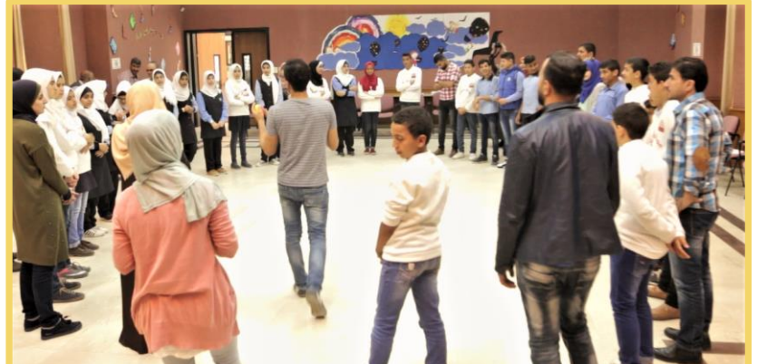
Inclusive Education Interactive Learning Session

(ii) The School which offers inclusive education to deaf and non-deaf children from Grades 1 to 9.