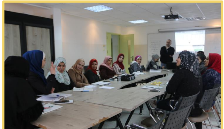
Sign Language Education Course

Moreover, during the year the sign language program played an important role in the adaptation of several large stores across the Gaza Strip, 22 local NGOs and a hospital facility. Specialized components were added to the sign language trainee manual (i) to suit Palestinian bank employees (ii) to suit the Islamic University adaptation component for students enrolled in their programs.