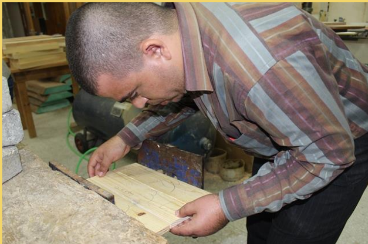
Carpentry Vocational Training at Atfaluna