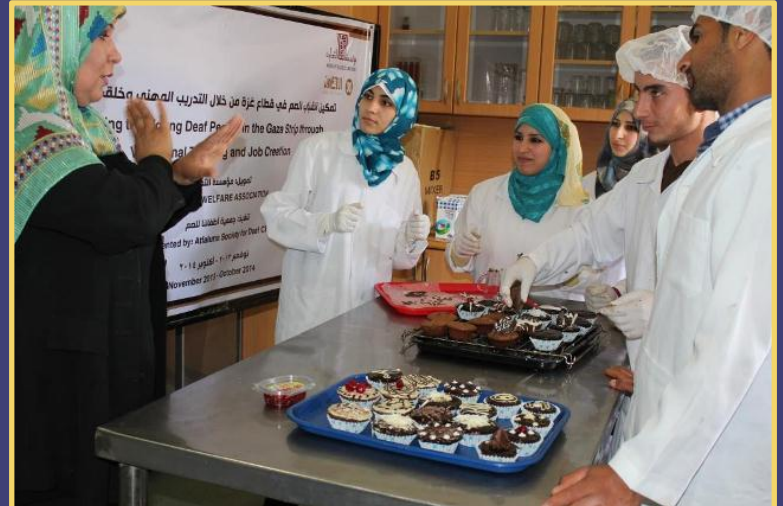
Cooking and Baking Vocational Training at Atfaluna